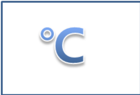
Fig.8-1 Standard Image