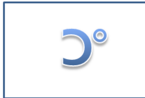
Fig.8-2 Horizontal Flipped Image